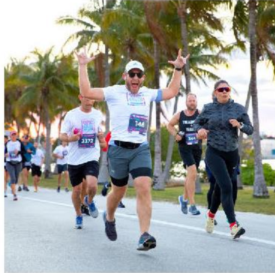
2022 Baptist Health 305 Half Marathon & 5K – March 6

Limited spots available! Register for all 3 events above as soon as you can to make sure your name is on the qualifying athlete list. Terms and conditions apply. Only confirmed registrants qualify.