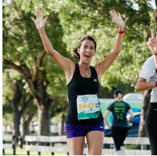
2021 Baptist Health Turkey Trot Miami 5K/10K – November 25

Complete any distance in each of the following 3 Life Time Miami Events and earn your sweet PINEAPPLE medal upon crossing the Finish Line of the 2022 Baptist Health 305 Half Marathon & 5K!