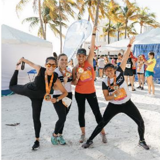
2022 Life Time Miami Marathon & Half – February 6